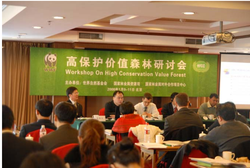
Fig 1. Participants at the Beijing workshop