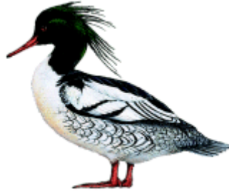
Fig 5. Scaly sided merganser

This is a forest dependent aquatic bird native to eastern Russia and northeast China. breeds below c.900 m in mountainous areas, along rivers with tall riverine forest, mainly within the temperate conifer-broadleaf forest zone. It is largely confined to primary forests, with an abundance of potential nest-holes. On passage and in winter it feeds along large rivers. It is listed by IUCN as Endangered, and is therefore likely to be considered a High Conservation Value species.