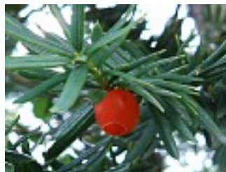
Fig 4. Taxus cuspidata (Chinese yew)

Taxus cuspidata (Chinese yew) is a regionally endemic tree species that is now protected by forest law in NE China. In the northeast, it is likely to be considered a High Conservation Value species. The protection of this species should be achieved through a number of specific measures, outlined below.