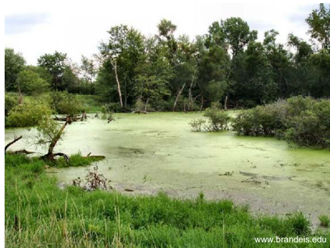
Fig 7. wetland habitat

In this example, an area of forest has been identified as HCVF because it protects a water course that is feeding an important wetland habitat. A potential threat to the habitat is siltation and pollution coming from the area of forest up-stream which is about to be logged, which would affect the wetland's ability to support a number of threatened plant and amphibian species.